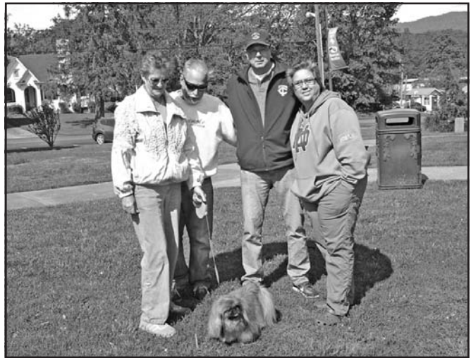
The Wildfire Preparedness event was truly a community experience.

"These wildfires that happened so close to home last fall, I think they really alerted people to how dangerous wildfires can be."