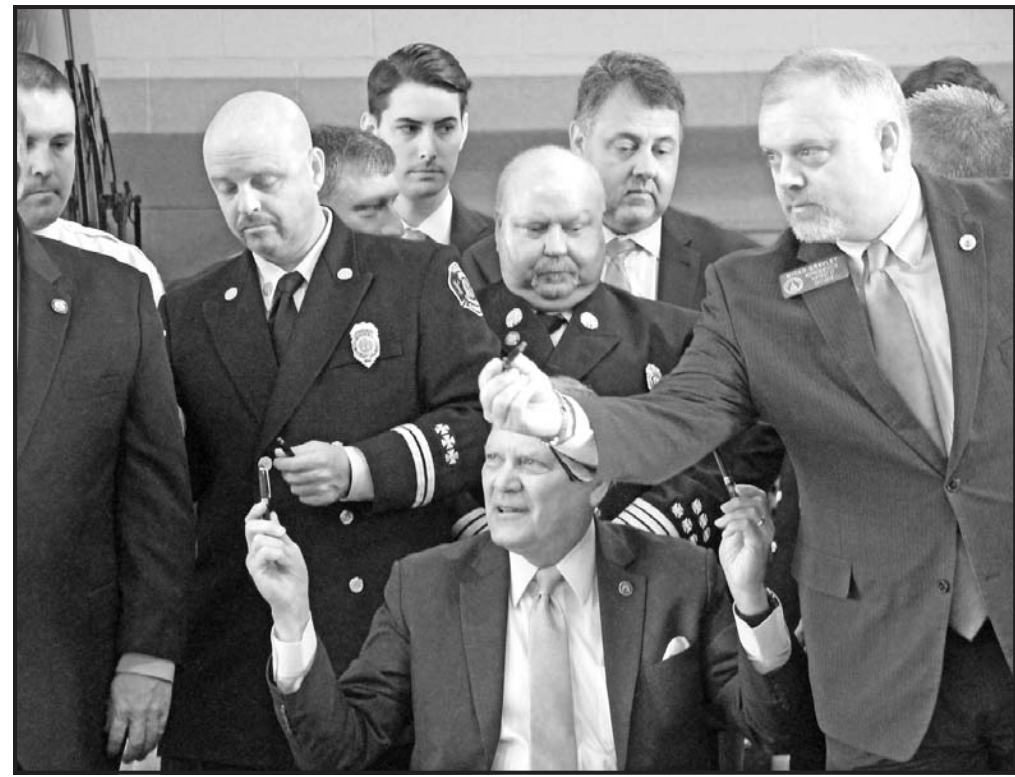
Gov. Deal handing out pens used to sign the landmark legislation, inside Gilmer County Fire Station No. 1.