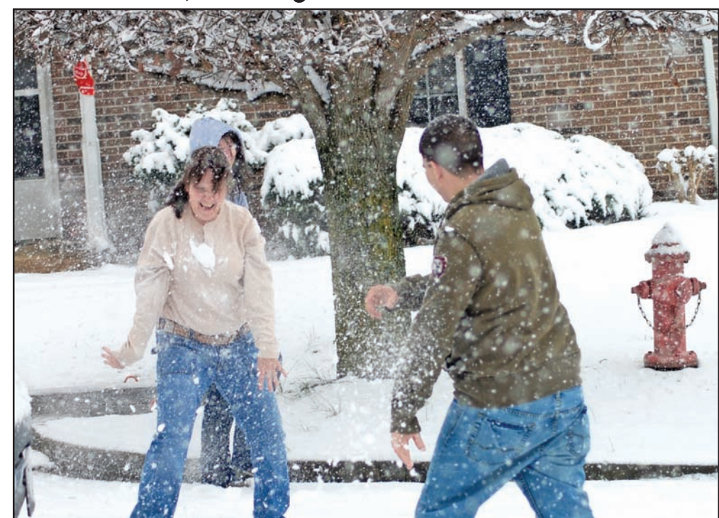
There's nothing better than a Christmas Day snowball fight in Towns County.