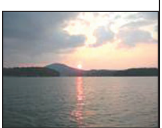
Upstream Elevation Predicted 12/29/10 Lake Chatuge 1918.26

Thur: Cloudy Fri: Cloudy 52 37 57 42 55 28 Sat: Rain Sun: Rain Mon: Sunny Tue: Sunny Wed: Rain