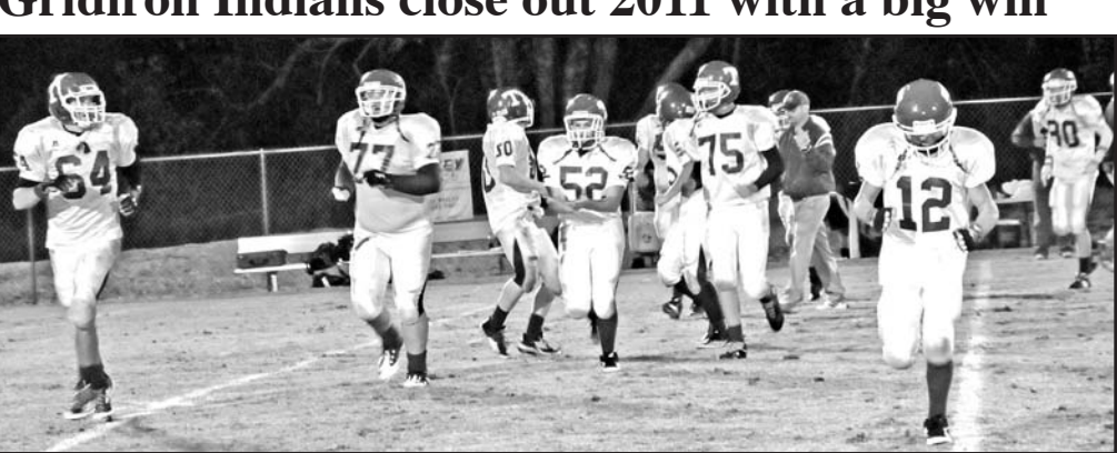
The Indians celebrate their upset over Hebron Christian Academy.