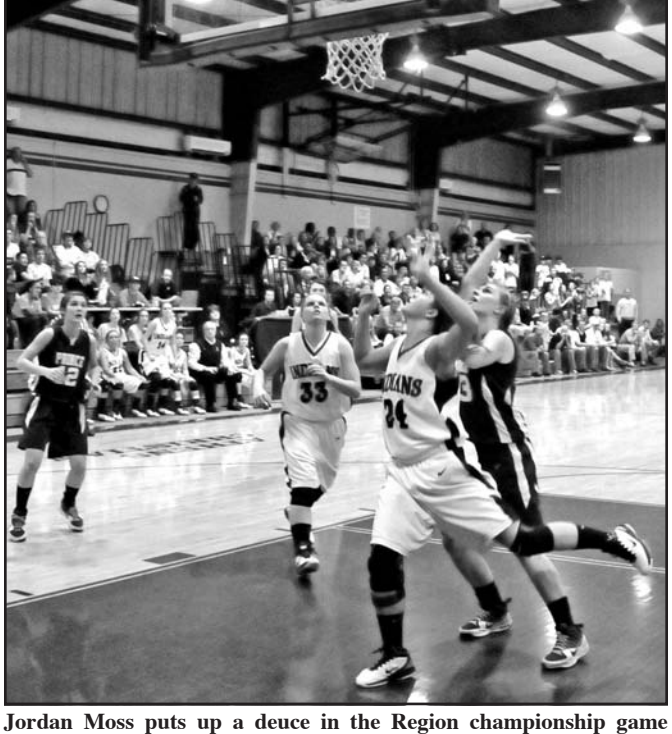
against Prince Avenue.

The record for most of basketball. 3-point baskets in a single basketball in Georgia now stands at 13 and the name Towns County High School.