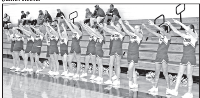
TCMS Cheerleaders cheer on the Lady Indians.