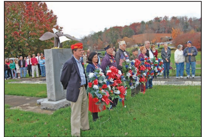
Towns County veterans were honored and remembered on Wednesday at Veterans Memorial Park with the traditional laying of the wreaths.

They served in the U.S. Army, Navy, Air Force, Marines and Coast Guard. They fought bravely during the wars dating back to the War to end all Wars . They served in combat from World War I to Afghanistan. Many continue the defense of our nation, taking part in a modern warfare known simply