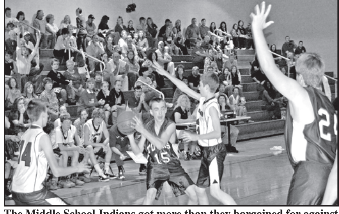
The Middle School Indians got more than they bargained for against the Fannin County Rebels on Thursday.

The fourth quarter featured a shoot out at the charity stripe and each team had troubles. When the final horn sounded, the Rebels were in control and returned to Blue Ridge with a 23-14 victory.