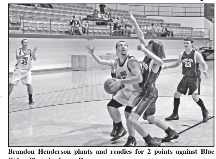
Ridge.

The Class A Indians open regular season play on the road