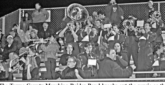
The Towns County Marching Raider Band breaks out the music as the Indians put points on the board.