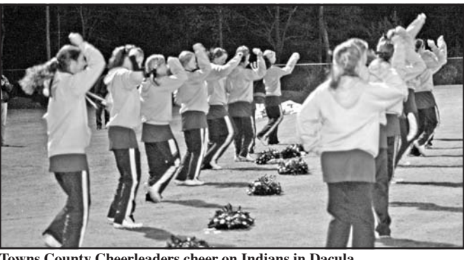
Towns County Cheerleaders cheer on Indians in Dacula.