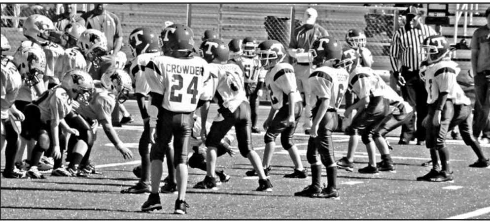
The Tiny Mites lost Saturday to the Union County Panthers on Saturday to fall to 6-2 on the Season.