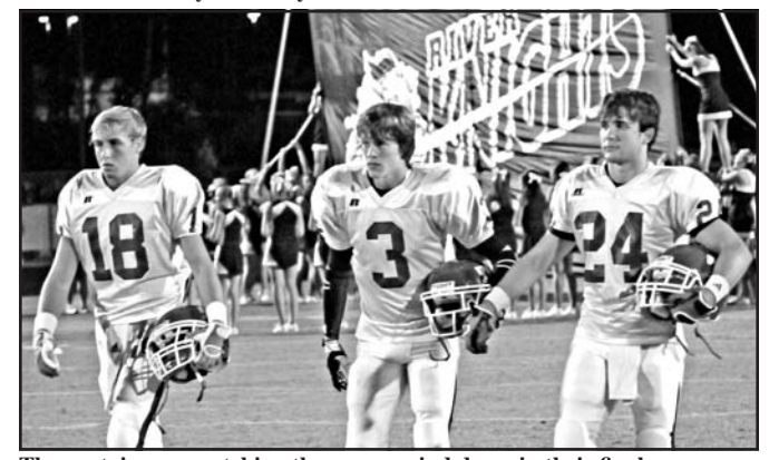
The captains are watching the season wind down in their final season.

find the end zone early in the but the damage was done as the fourth quarter on a Jackson Knights sent the Indians back