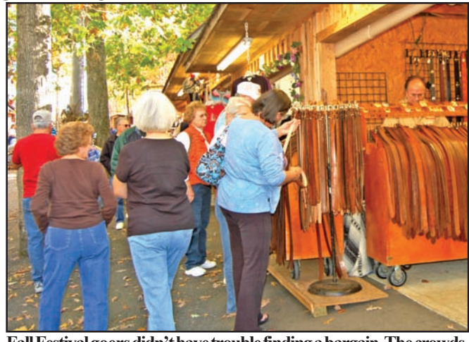
Fall Festival goers didn't have trouble finding a bargain. The crowds, like the bargains, were abundant.

Cooler temperatures played a significant role, as did the rapid changing of the color of the fall foliage.