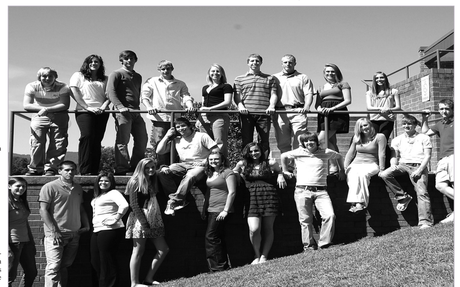
It's homecoming for Towns County High School on Friday night as the 2009 football homecoming king and queen will be crowned. The Indians face Georgia Military on the gridiron. Come out and support the Indians and take in the festivities as a group of beautiful young ladies and handsome gentlemen vie for the title of Homecoming Queen and King.