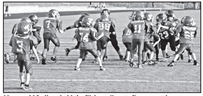
10 year old Indians hold the Pickens County Dragons at bay.