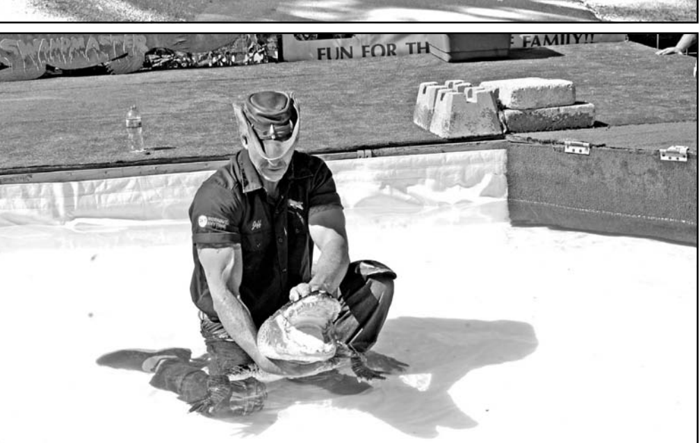
The Pioneer Village has been a hot spot for visitors at the annual Fall Festival. The Swampmaster also has been putting on quite a show demonstrating his mastery over alligators.