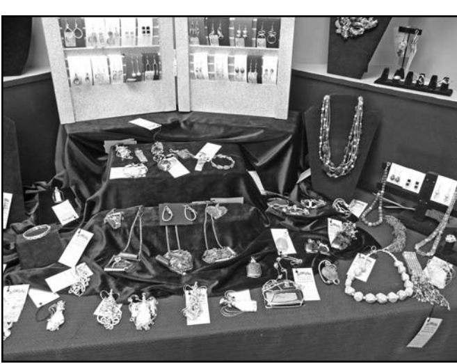
A true art lover can spot Evelyn Gantnier's work at first glance.