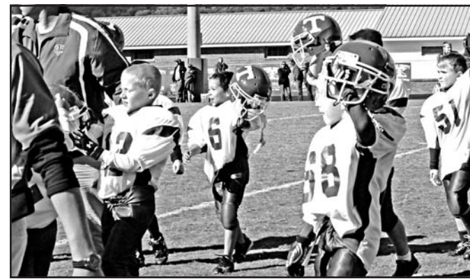
The Tiny Mites celebrate win Number 6 on Saturday.

Wees dropped a heartbreaking, hard fought loss 34-32 to the Gilmer Bobcats. Likewise, the 11-year-old Midgets suffered a tough defeat at the hands of the neighboring Union County Panthers 18-12.