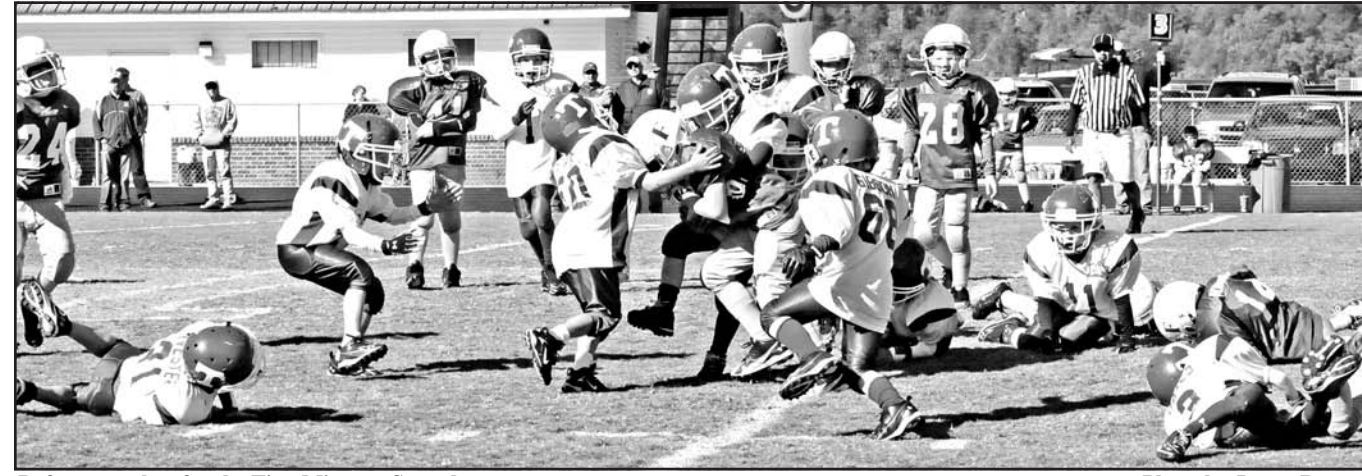
Defense was key for the Tiny Mites on Saturday.