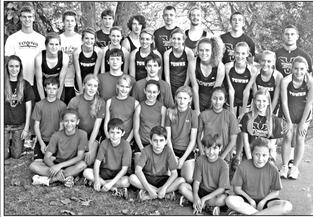
Cross Country teams competed at Murphy Invitational Meet last week.