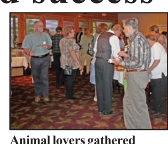
Animal lovers gathered during the weekend to benefit the Mountain Animal Shelter's no kill facility.

Sometimes, the shelter sends animals to other "no