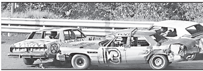
Tri-County will try to get the show in this Sunday

For the third time, the Aarons Sales and Leasing 35-lap Southeastern Late Model Sportsman Series $1200 to win race fell to Mother Nature at the third mile Tri-County Race Track in Brasstown, North Carolina. With the track all prepared for the Sunday event, rain came in early in the morning and never let up.