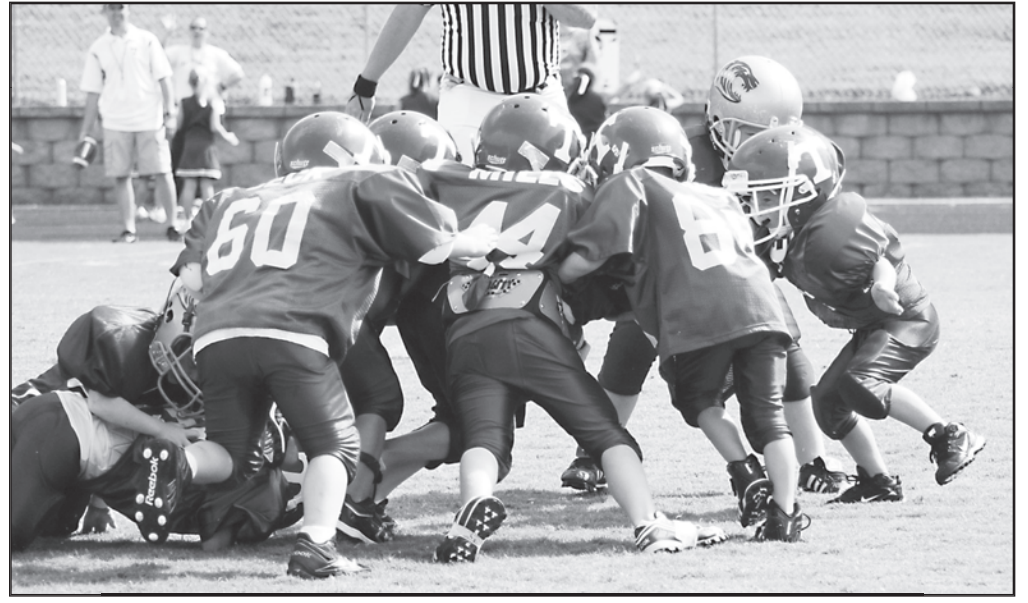
When your team is called the Termites, gang tackling is a necessity

Ivester wasn't through; he had another 87-yard touchdown run but was brought back due to penalty. Undeterred and unfazed he later scored from 47 yards out from the line of scrimmage with 3:06 left to ice the game and seal the Indians' victory with a final score of 25-12.