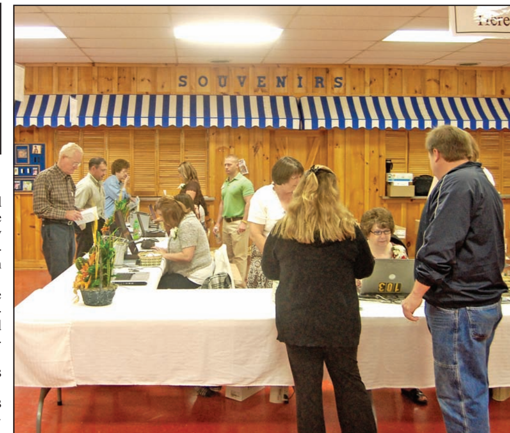
Blue Ridge Mountain EMC Customers register for door prizes. Almost 500 members of the cooperative attended the 77th Annual Meeting at Anderson Music Hall.