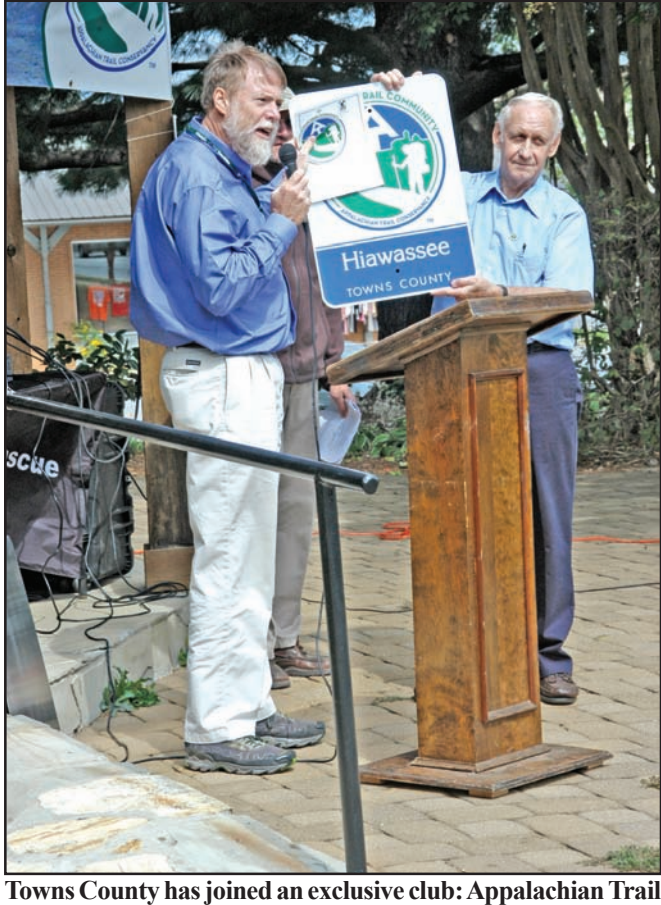
Community. It's one of three in Georgia.