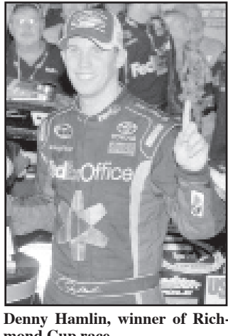
mond Cup race