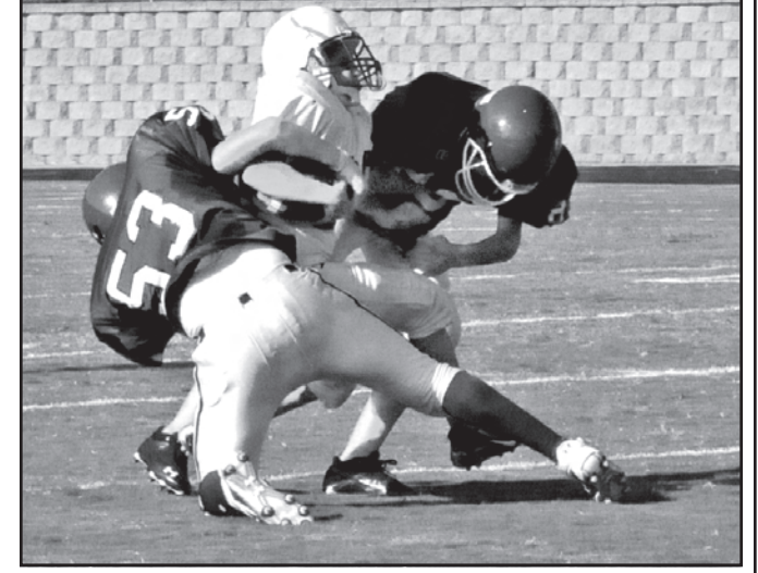
The Indians double-teamed the Lakeview quarterback all day long in the 28-0 win last week.

"We've still got room to improve. We missed some tackles here and there," he said. "We're going to try and get better each week.