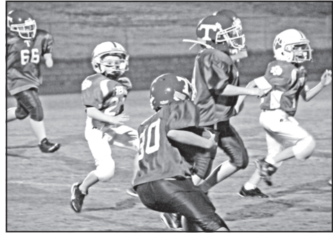
The Indians Youth Football program is off to the races in the early going this season.

Towns County Youth Football is alive and well in Hiawassee.