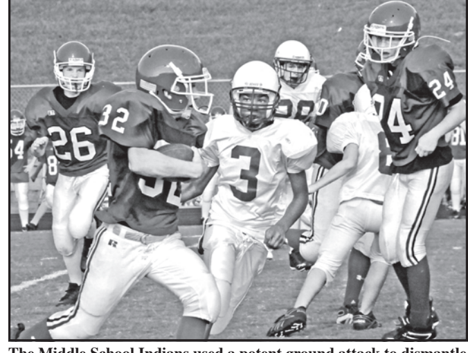
The Middle School Indians used a potent ground attack to dismantle Lakeview Academy last week in Hiawassee.