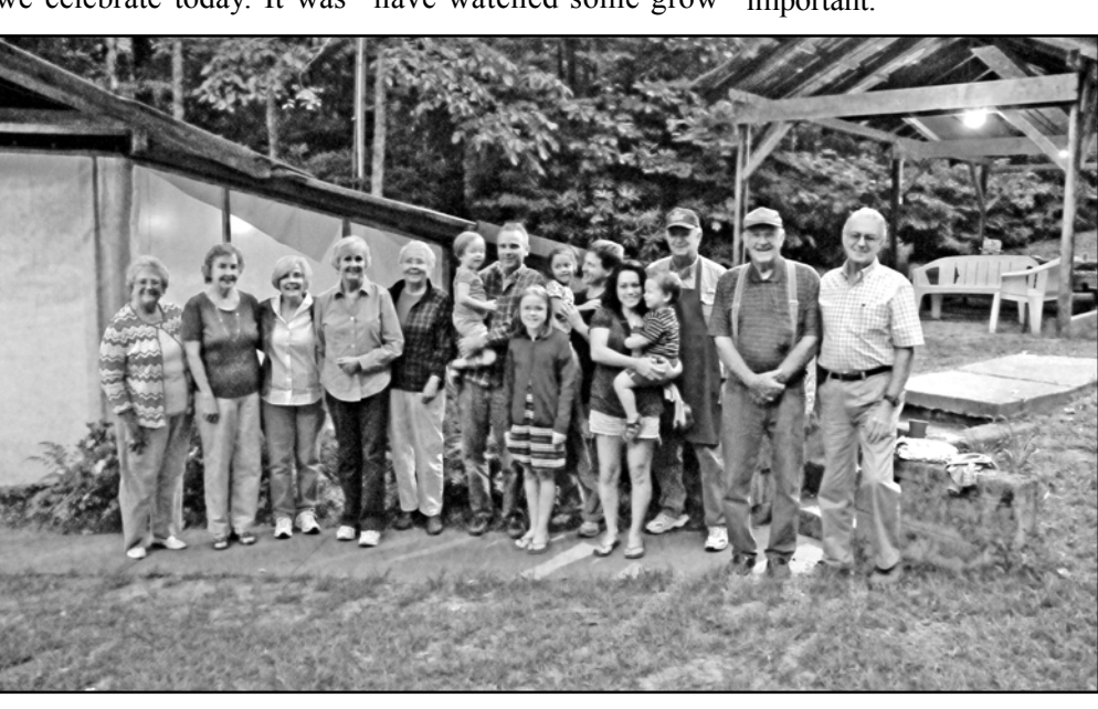
Family and friends of the Buttrill Family of Soapstone gathered Saturday for the 41st annual Labor Day Celebration in the historic Towns County community.

"It's days like this that remind us of what's really "It's a fun night to get important in life," he said. "Friends, family and strong bonds, it's what life is all about. That's what is really important.'