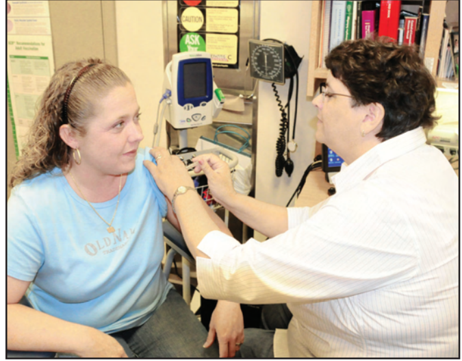
The Towns County Health Department wants locals to know that free shots are available at the Health Department.