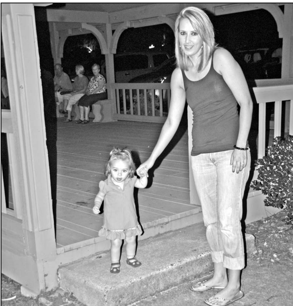
These ladies love fireworks and they got their fill on Labor Day weekend.