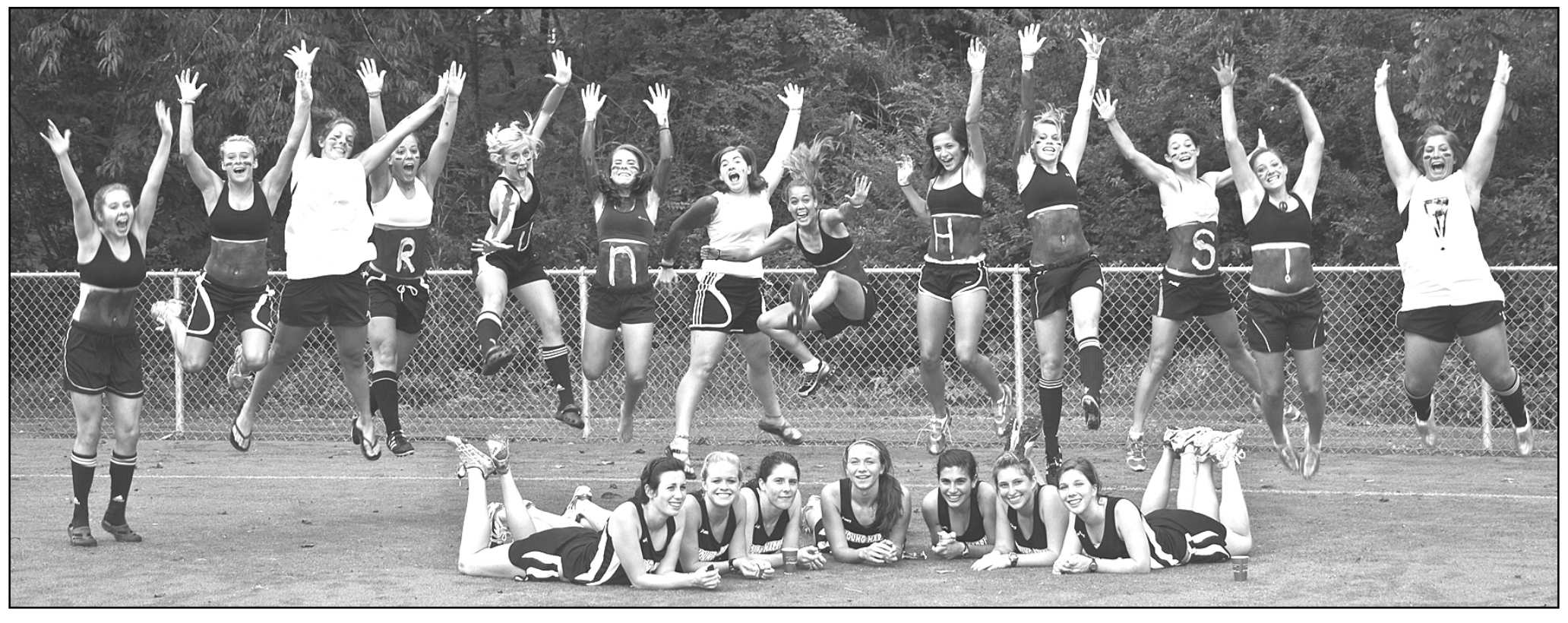
The YHC women's soccer team celebrates the CC win by the Lady Mountain Lions.