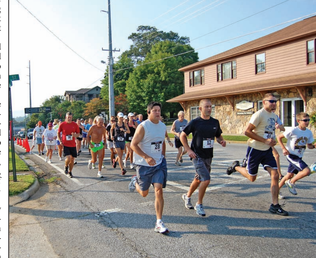
More than 40 runners turned out to take part in the Relay for Life 5K Run in Downtown Hiawassee on Saturday to raise money for the American Cancer Society.