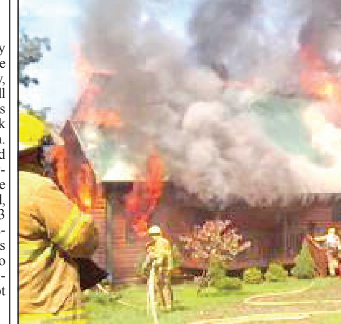
Towns County firefighters try to contain a blaze that investigators believe was started on Friday evening by a bolt of lightning. It was the second suspected lightning-related blaze fought on Friday.