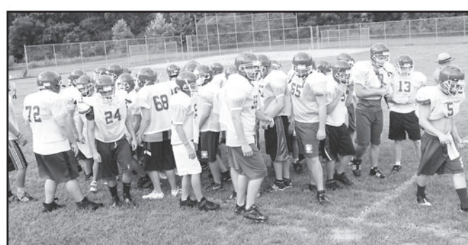
Indians get ready for a long day of practice