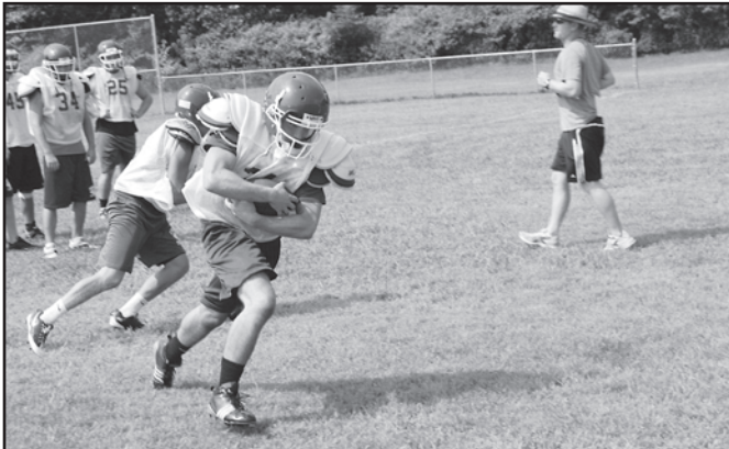
Running drills never gets tiresome

The clash between the Panthers and the Indians also expects to attract a crowd to see the two non-region opponents go head-to-head.