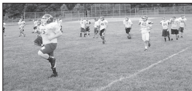
The morning routine remains the same