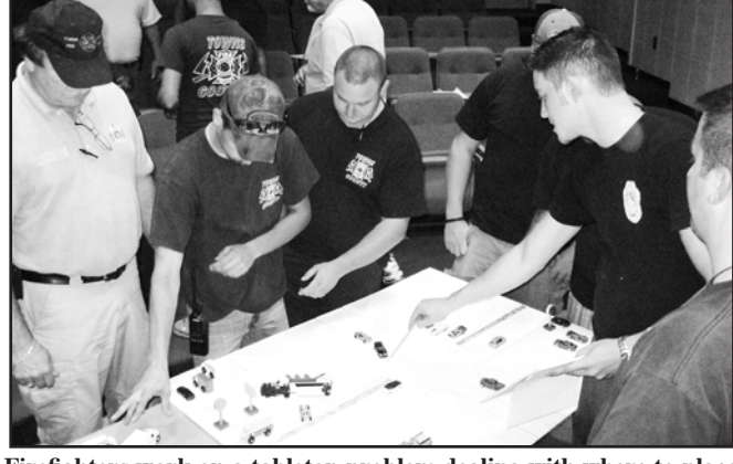
Firefighters work on a tabletop problem dealing with where to place emergency vehicles arriving on an accident scene. Divided into several groups each had to place the responding vehicles at the "scene" and relate why they selected that placement.

public service is urged to contact the Fire and Rescue unit who like the Marines are always looking for a few good men and women. T(Aug4,H2)SH