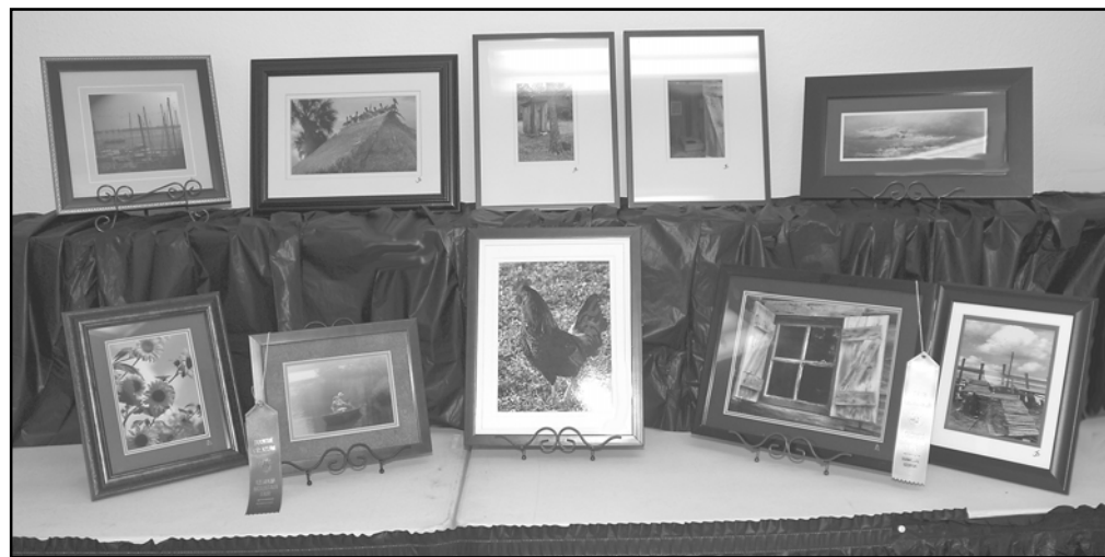
Photos at the GMF Photo Exhibit