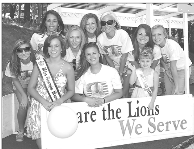
Miss GMF contestants ride the pageant float in the annual parade.