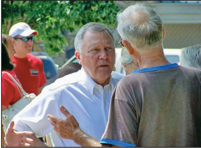
Ninth District U.S. Rep. Nathan Deal will speak to the Towns County GOP on Aug. 4th at Daniel's Steakhouse. Deal currently is the GOP front-runner for governor in 2010.

First elected to Congress in 1992, Deal, one of the most respected lawmakers ever to go to Washington, has represented most of North Georgia during that time. The long-time Congressman has never lost a political race and during his 1996 Congressional reelection campaign, Deal earned the highest victory percentage of any Congressman during that General Election.