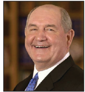
Gov. Sonny Perdue