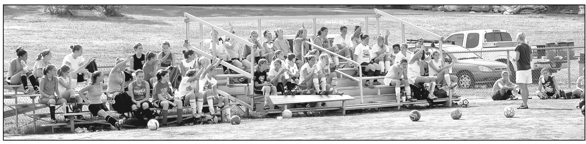
Forty-seven girls attended the 2009 YHC women's soccer camp.