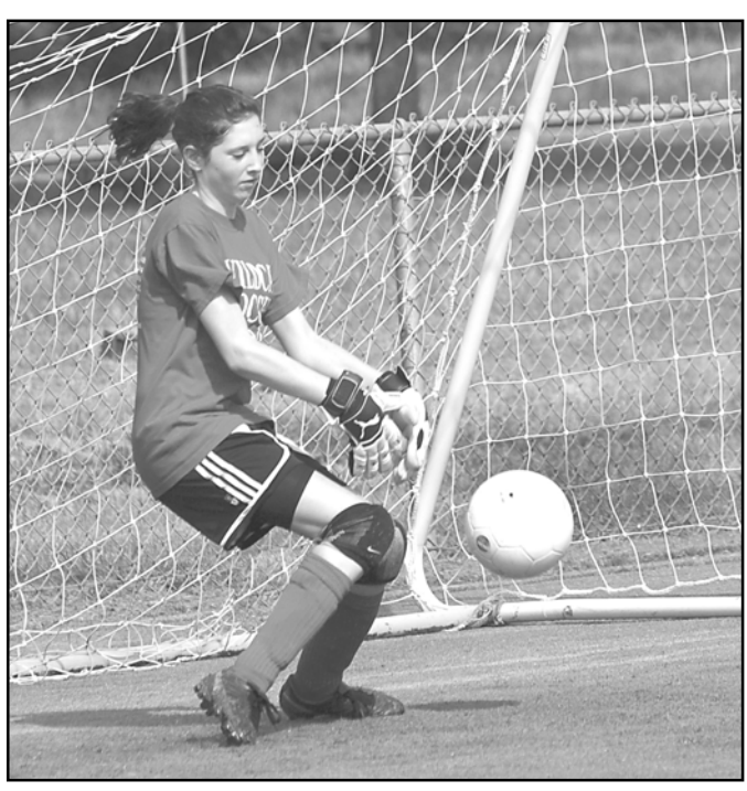
Goal tending skills were practiced during the Saturday morning