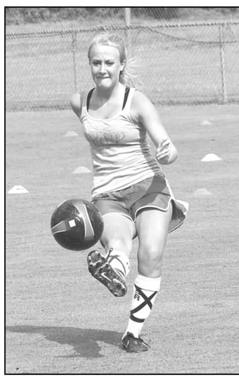
One of the older players taking a shot on goal at the YHC Soccer Camp.