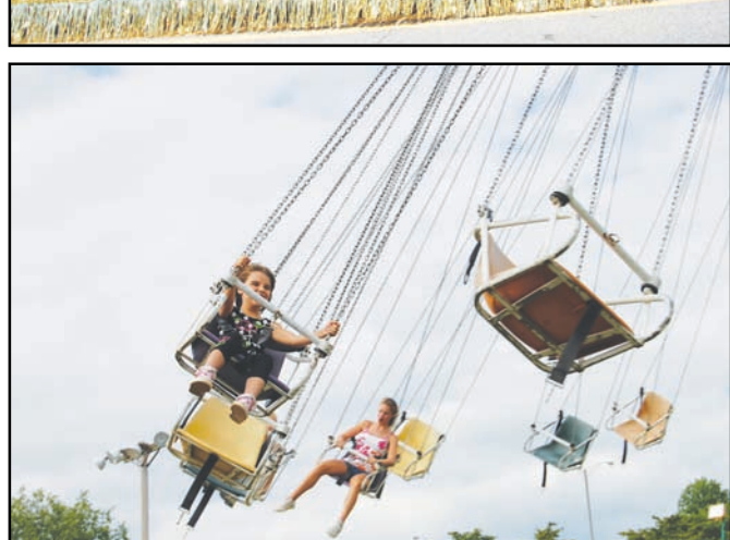
From parade floats to carnavel rides, the Georgia Mountain Fair was a major attraction for tourists last week in Hiawassee.