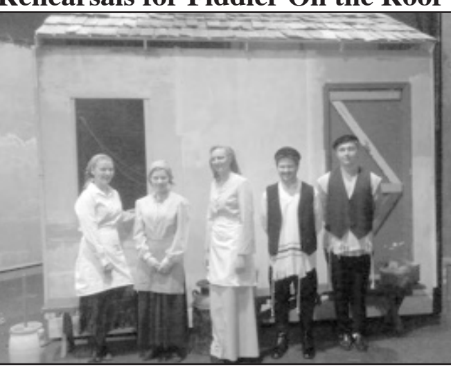
Partial cast at rehearsal Is This the Little Girl

I Carried? Is This the Little Boy at Play? I don't remember growing older. When did