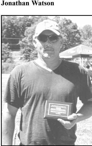
Men Single's Horseshoes