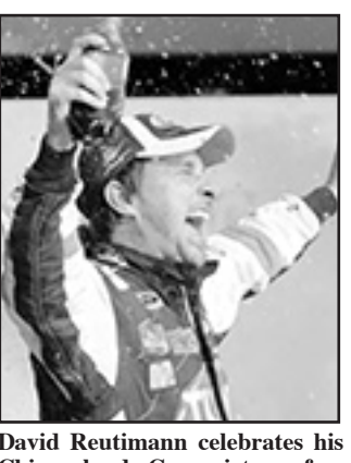
Chicagoland Cup victory fur-nished by NASCAR