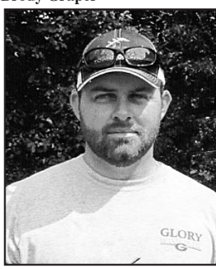
Activity Day, Men's Homerun