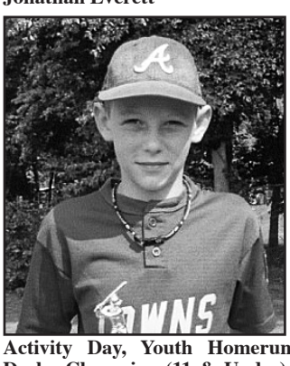
Derby Champion (11 & Under),