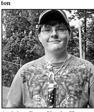
Activity Day, Youth Homerun Champion, and Youth Singles Horseshoe Champion