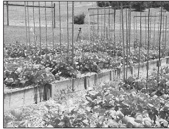
2010 Green Bean Yield Trials

The Georgia Mountain Research and Education Center is located 3 miles south of Blairsville, Georgia on Hwy 19/129 S. The station grounds cover 415 acres of orchards, test plots, pasture land, specimen and preservation gardens,