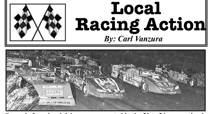
Several of our local drivers are expected in the 20 to 24 cars racing in Saturdays Southeastern Sportsman Series $1,500 to win race.