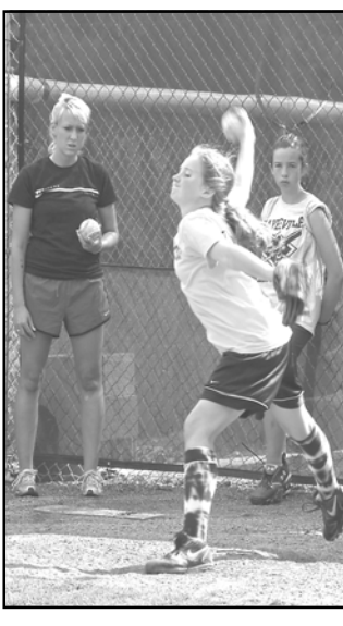
works on pitching with a softball camp participant.