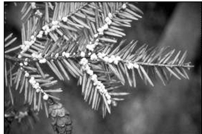
The adelgid adult and her eggs, covered by a woolly covering, is a sign that your tree is infected.