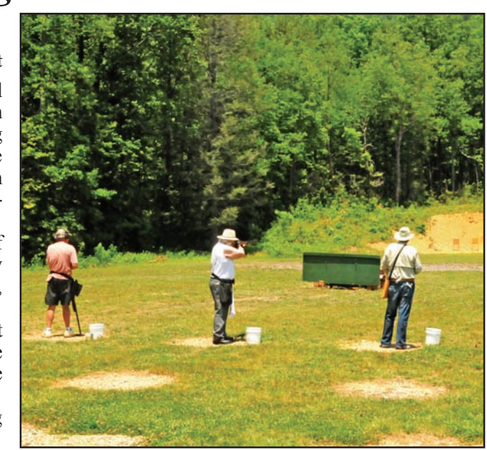
Shooters braved hot temperatures to raise money for the Georgia Sheriff's Association Youth Homes.