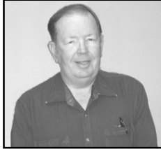
Murphy hot shoe takes $1000 victory at Tri-County