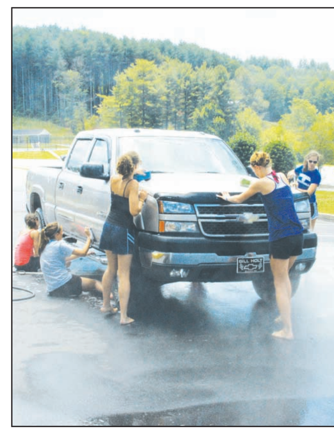
Members of the Towns County Lady Indians' Basketball team wash down vehicles on Saturday to raise money for the summer's

The players donned summer-time clothes and went to work washing cars to raise money for the See Lady Indians, page 12