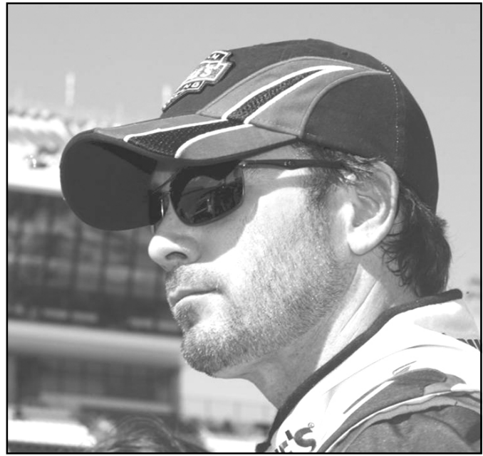
Jimmy Johnson, winner of Sunday's Dover Sprint Cup race

You may contact the Racing Reporter at: hodge@earthlink.net.