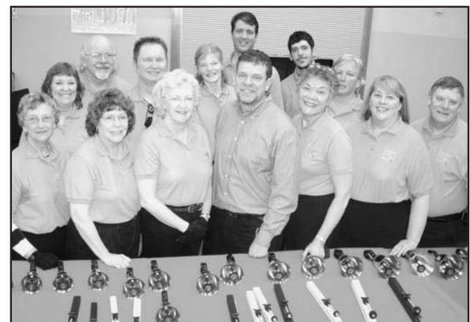
Brasstown Ringers are from parts of Georgia and North Carolina