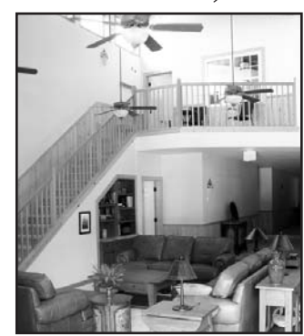
Interior of Lodge

The recently renovated lodge is all beautifully decorated one bedroom, one bath suite accommodations (plus sofa beds in each suite), with high speed wireless Internet access, flat screen televisions with Direct TV, personal kitchen areas with sinks, mini-fridges, and small dining tables, and personal screened-in porches (including porch swings on most units). A handicapped suite is available. All rooms are non-smoking and breakfast is included each morning.