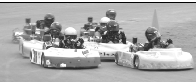
Go Karts will be roaring around Tri-County on Friday nights.

Admission to the kart races will only be at the pit gate and cost $10. The gate will open at 4 p.m., with racing starting at 7:30. Visit www.tricountyracetrack.com for more information about Tri-County Race Track.