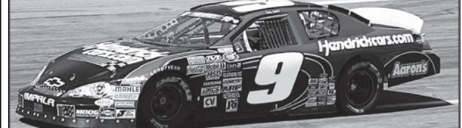
Chase Elliott will one day race with Jeff Gordon and Jimmie Johnson.