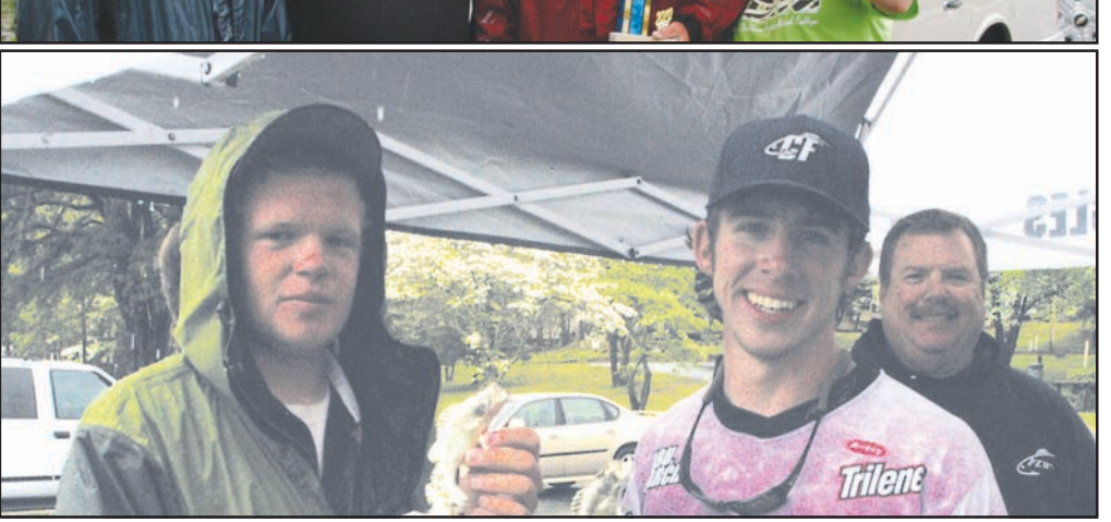
The winning team of O'Dillon/Holloway pose with friends and family. Rutherford and White share a moment after finishing second in the Lake Chatuge Collegiate Bass tourney.