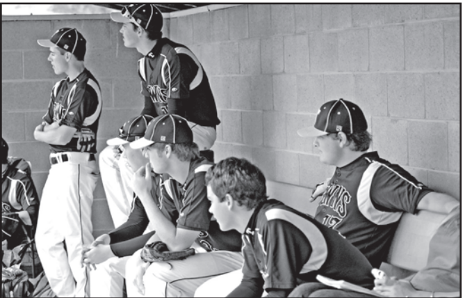
The Towns County Indians have begun to jell as a team scoring 49 runs in their last three games