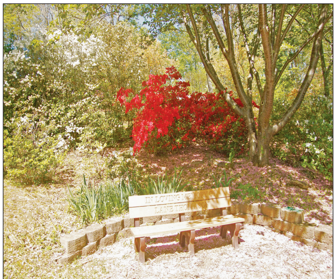
Hamilton Gardens has been a sight to see this spring at the Georgia Mountain Fairgrounds.