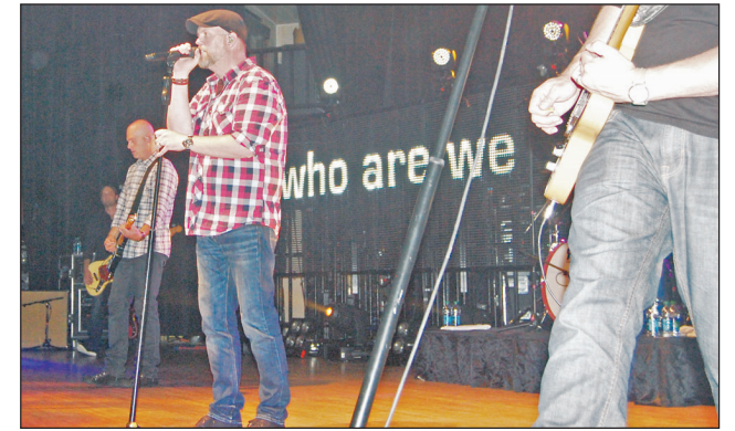
MercyMe lead singer Bart Millard sings before a crowd at Anderson Music Hall on Saturday.