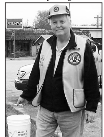
at the McDonald's intersection on the first day of the drive, Friday,